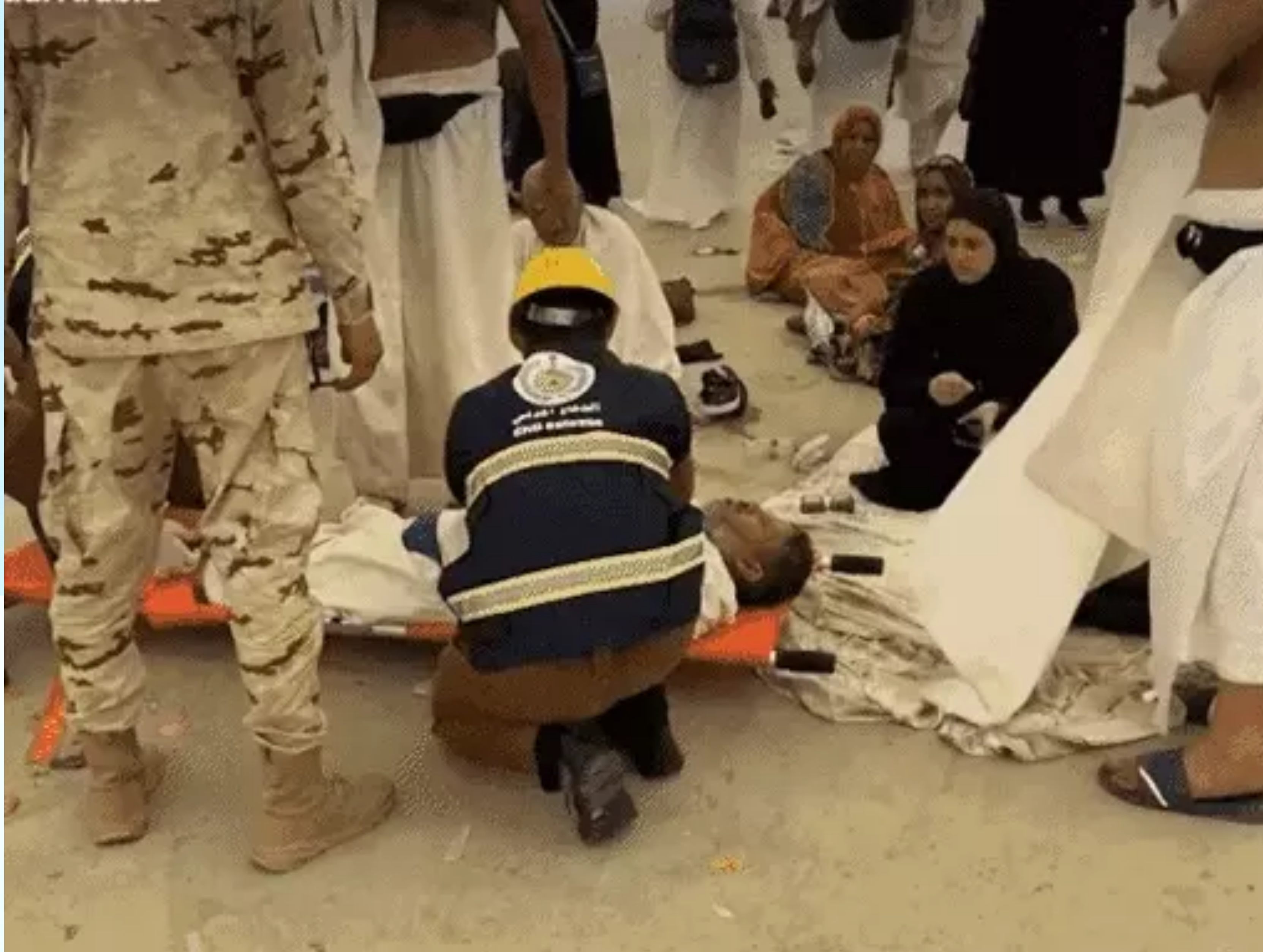
Pilgrims who reached Saudi Arabia for Hajj are dying due to the heat. Among the dead are citizens of Iran, India, Indonesia, Egypt and Tunisia.