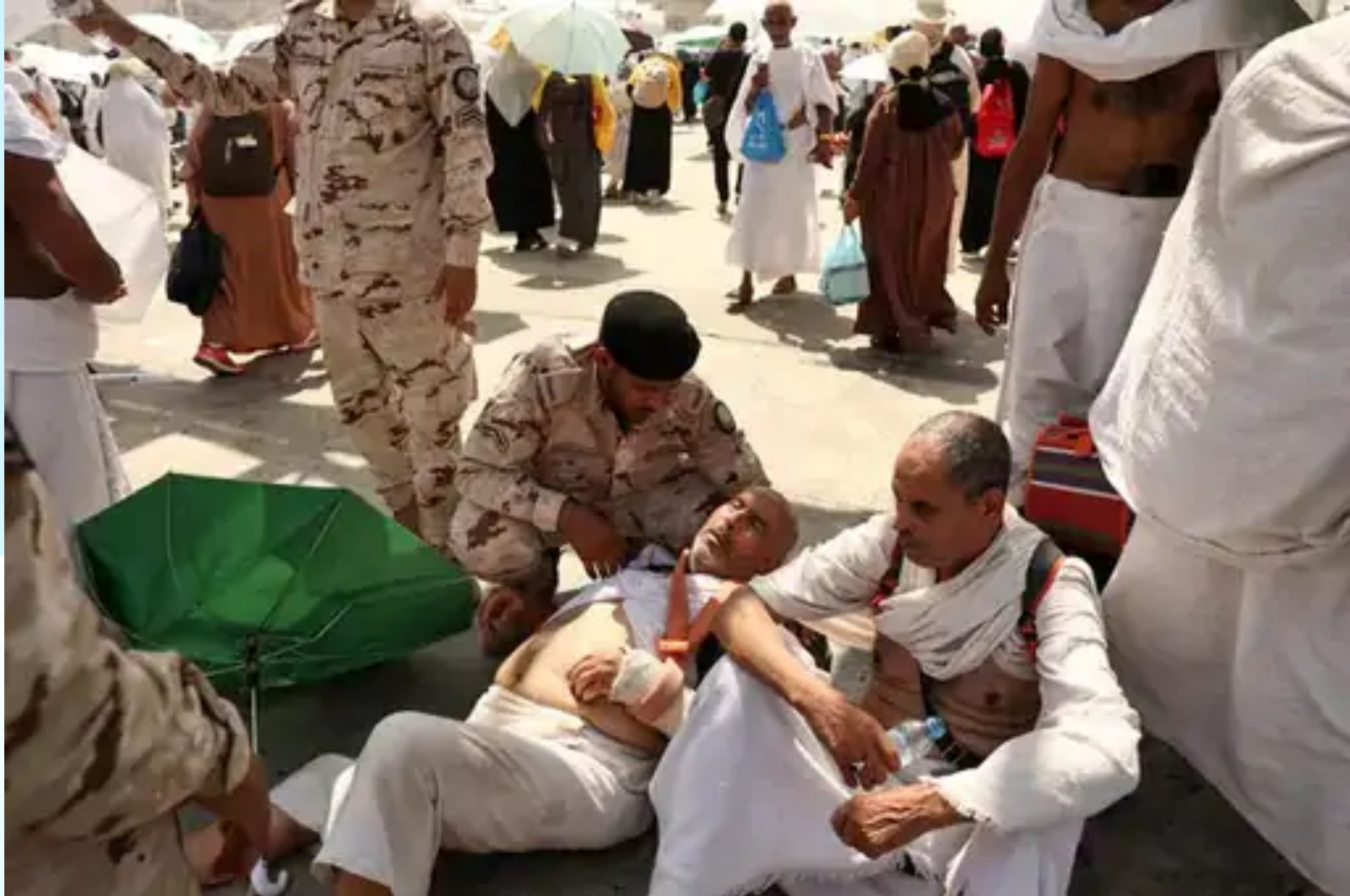
Haj pilgrims in Mecca have fallen ill due to the scorching heat.