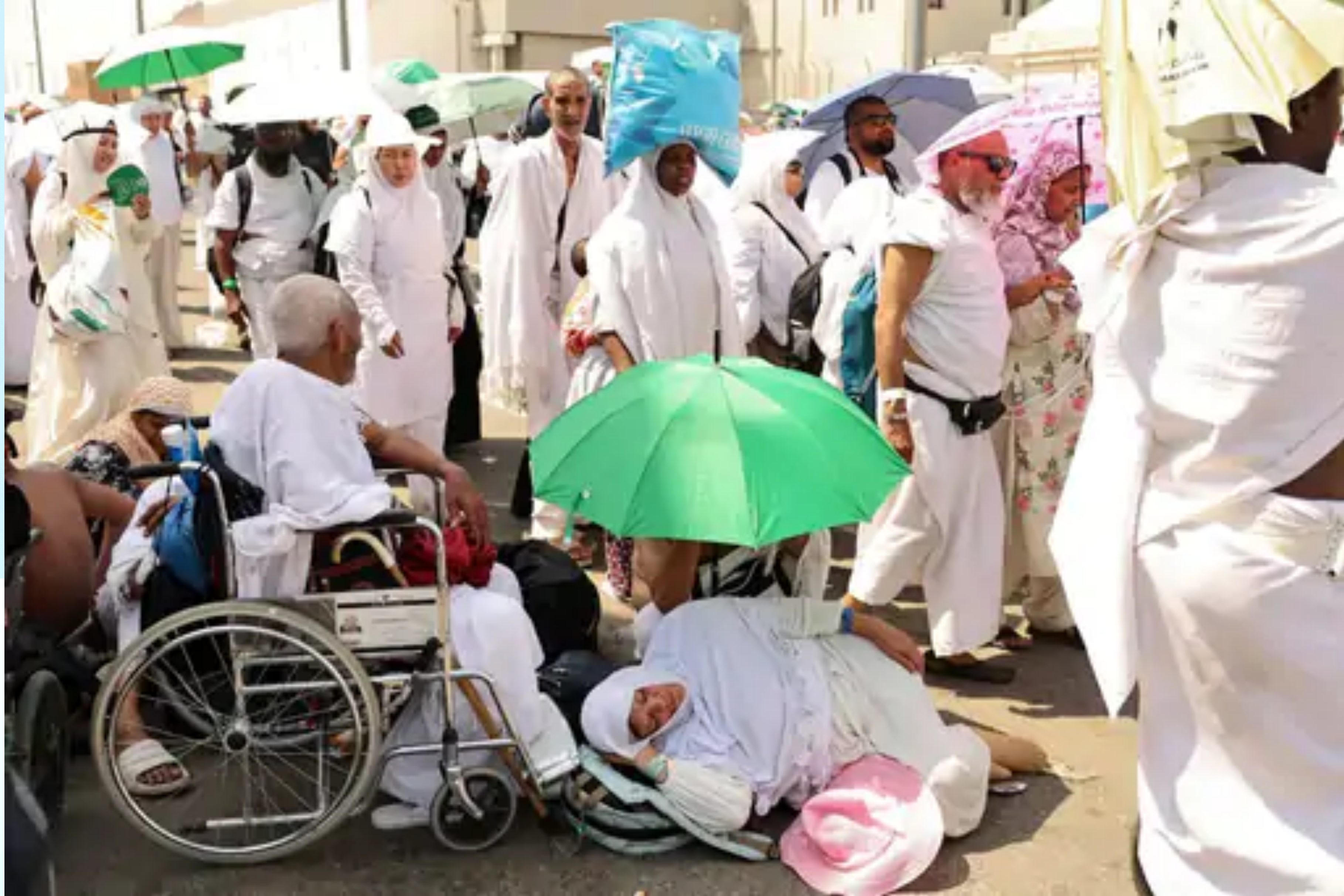
The picture is of Mecca, where the pilgrims who came to perform Haj are seen suffering from the sun and heat.